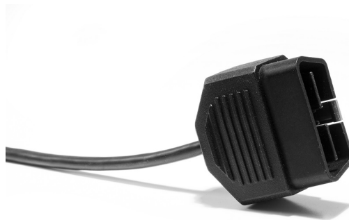
Figure 3: OBDII Type B CAN connector.

The CAN connector for the Kvaser U100-X3 is the 16-pin OBDII Type B plug which has the pinning described in Table 2.