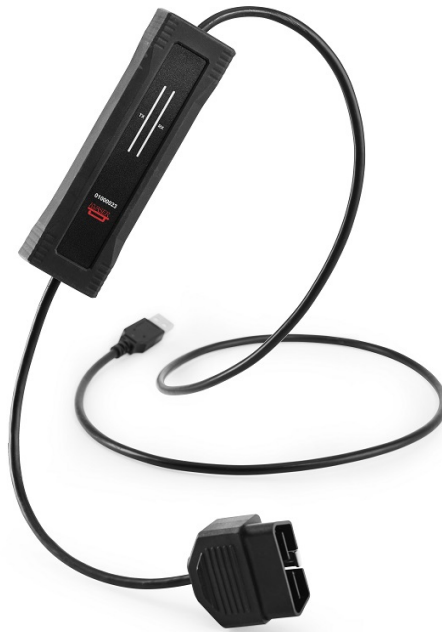
Figure 1: Kvaser U100-X3

Kvaser U100-X3 is a small, yet powerful, CAN to USB interface. It provides real-time transmission and reception of standard and extended CAN messages on the bus with a high timestamp precision, and is compatible with applications that use Kvaser's CANlib.